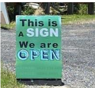
Keeping it simple in Mullumbimby (with the use of only one two-syllable word)