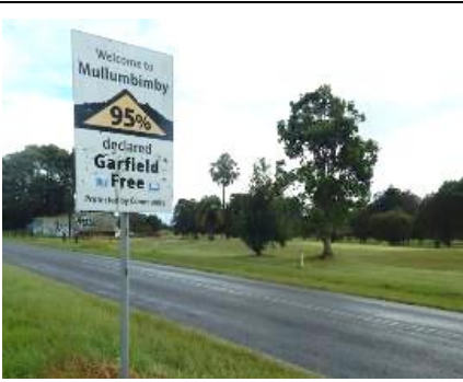
The Golf Club continues to live in hope that there's still a 5% chance of a gas bonanza beneath Garfield's fairways.