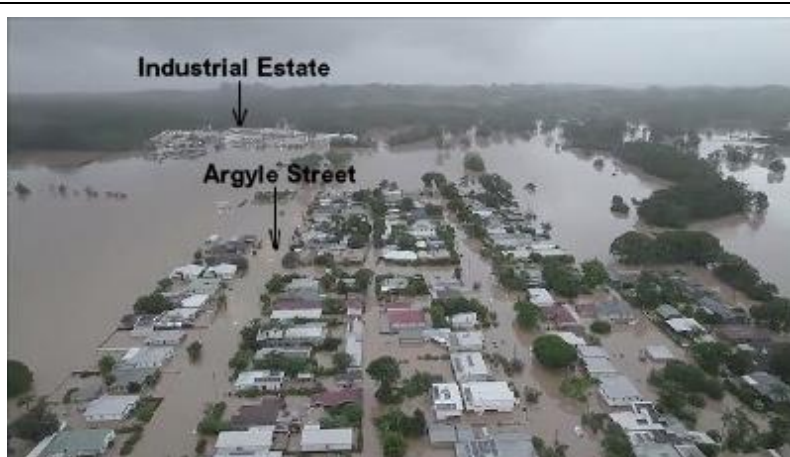
East Mullumbimby 28Feb2022

It's yours for $1,695,000. Meanwhile, the congregation has regrouped, at least temporarily, and now meets for services at 91 Main Arm Road, the site of the SDA school which closed its doors Dec2008 and is currently on the market.