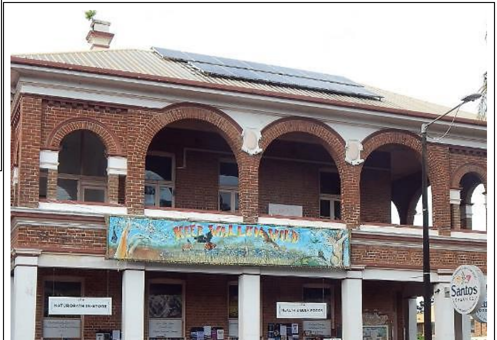
In Burringbar Street Santos continues to keep the locals abreast of environmental threats.