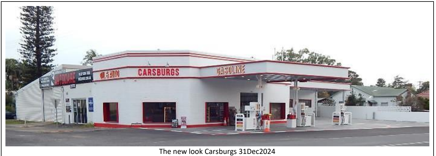
The new look Carsburgs 31Dec2024