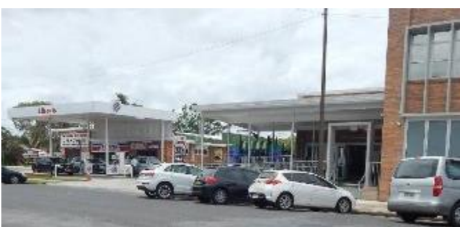
The RSL has also been into home renovation, with the introduction of the Northside Café and Kids Playground in front of the old squash courts, serendipitously on the site originally occupied by Everitt's Café . The Liberty Fuel Station next door is on the site of the Evans & Farmer Motor Garage opened in 1923*.