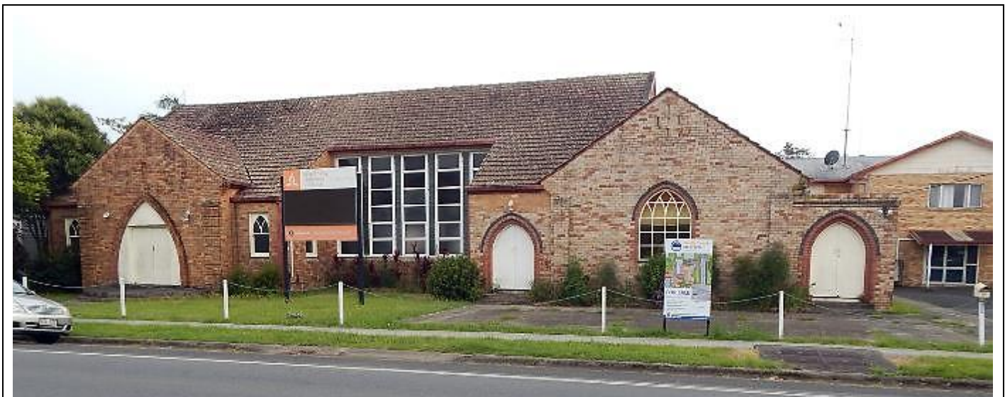
The 'For Sale' signs appeared on the Seventh Day Adventist Church in Dec2024.

The Seventh Day Adventist Congregation was faced with some hard decisions following the floods of Feb/Mar2022. Ultimately it was decided that restoration wasn't cost effective, a far cry from 1961 when the place was opened with great fanfare and a boast that the congregation was the largest of the denomination between Newcastle and Brisbane, and the second largest church at Mullumbimby.... (See BVHS Newsletter-March-2022. )