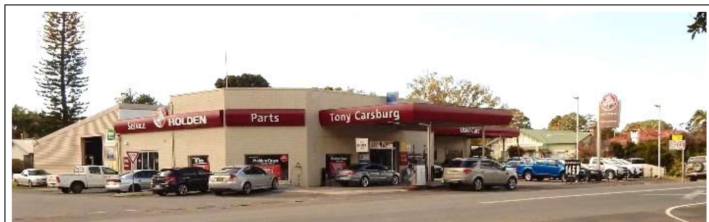
Carsburg Showroom displaying the latest Holden Cruze 2015 (and unleaded at 145.9 cpl)