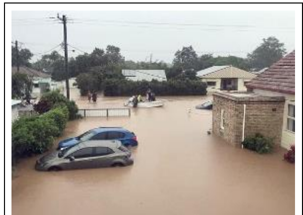
The Adventist Carpark facing Argyle Street, Feb2022

https://www.youtube.com/watch?v=eGejeaB8E60