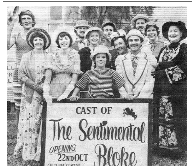
Hollywood Hopefuls at the Cultural Centre Oct 1982.