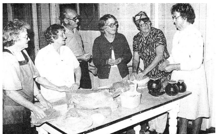
Potters at the Drill Hall Cultural Centre May 1978.