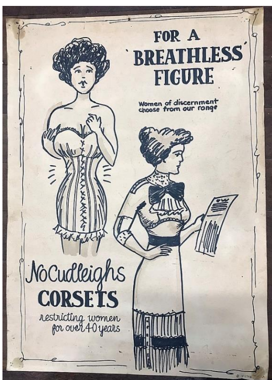
A2-sized poster drawn by Barb Hosie for a corsetry display in the 'Women's Room', ~1990, and used in the 'Intimate Apparel' Exhibition' Dec2020 (ref 102-Newsletter-Dec-2020-Jan-2021.pdf ( mullumbimbymuseum.org.au ))

(Barb's drawing and graphic skills were in demand on many occasions, including the illustrations for the 'Brunswick Valley Historical Society Cookbook, by the 'Friends of the Museum', a money raising venture by BVHS in 1989.)