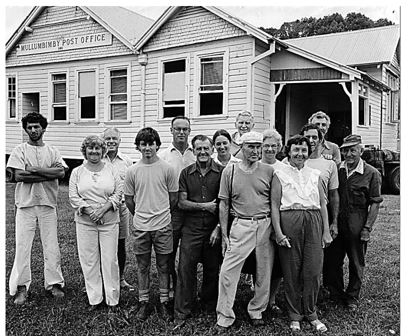
BVHS members Nov1984 (posing with the Post Office still on its delivery trailer, awaiting rebirth as a Museum.)

(Barb's drawing and graphic skills were in demand on many occasions, including the illustrations for the 'Brunswick Valley Historical Society Cookbook, by the 'Friends of the Museum', a money raising venture by BVHS in 1989.)