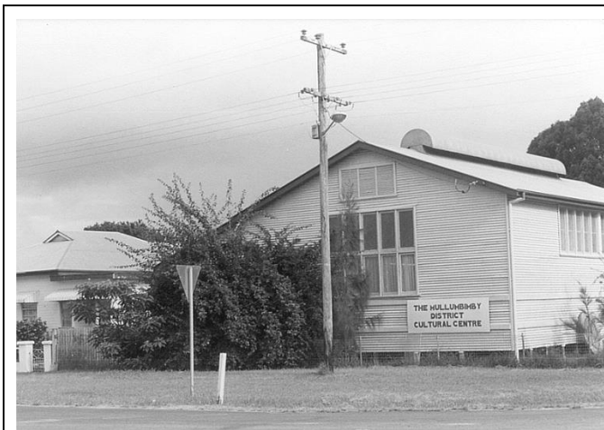
The Drill Hall as Cultural Centre 1977.