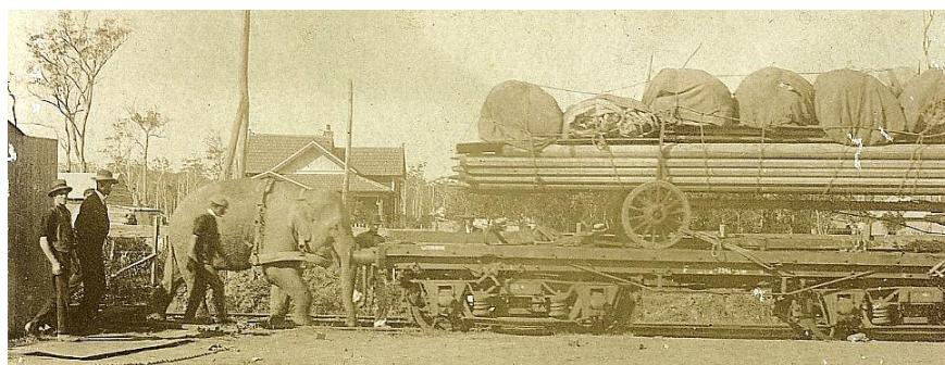
Elephant helps unload Wirth's Circus, Mullumbimby Station, 1910.