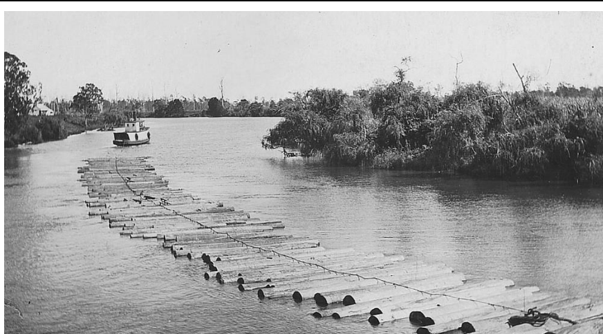
'Modern' Rafting on the Richmond