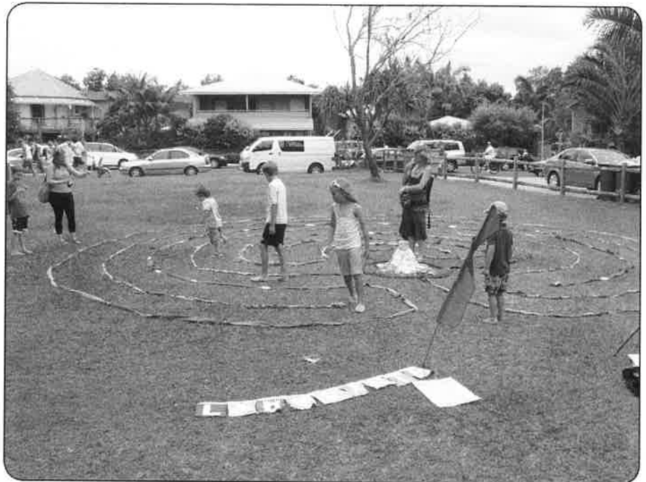
An example of a labyrinth that will be set up at the picnic

MARKET DAY (3RD SAT OF THE MONTH) 9 AM -12 PM