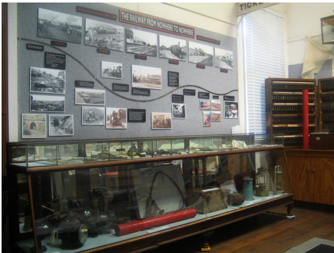
The Railway Display (almost completed) – just a photo or two to add

Copies are available at the museum for $16 each. If you would like a copy mailed add $6 for postage & packaging.